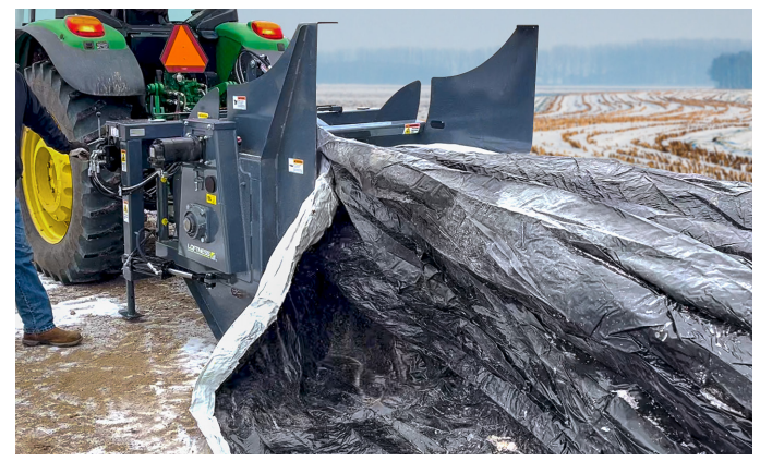
Winding the Bag