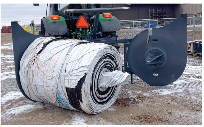
Wrapped & Ready for Recycling