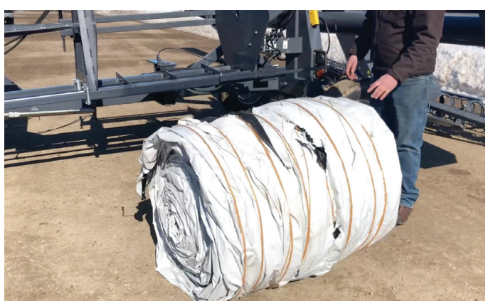
Wrapped & Ready for Recycling