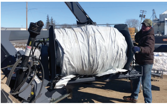
Turn for Tying & Discharge