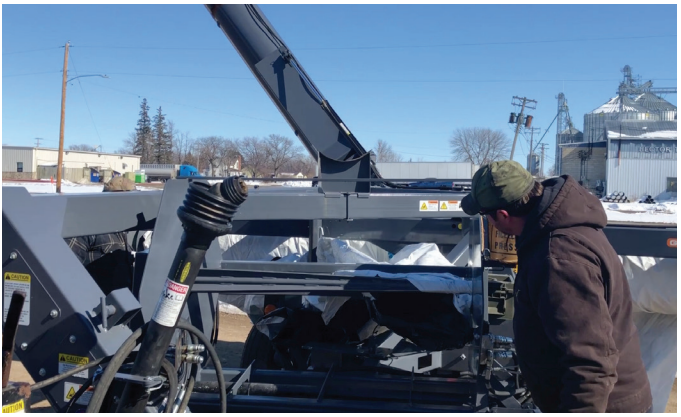
Starting the Bag