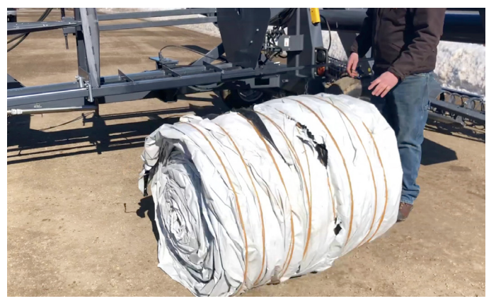
Wrapped & Ready for Recycling