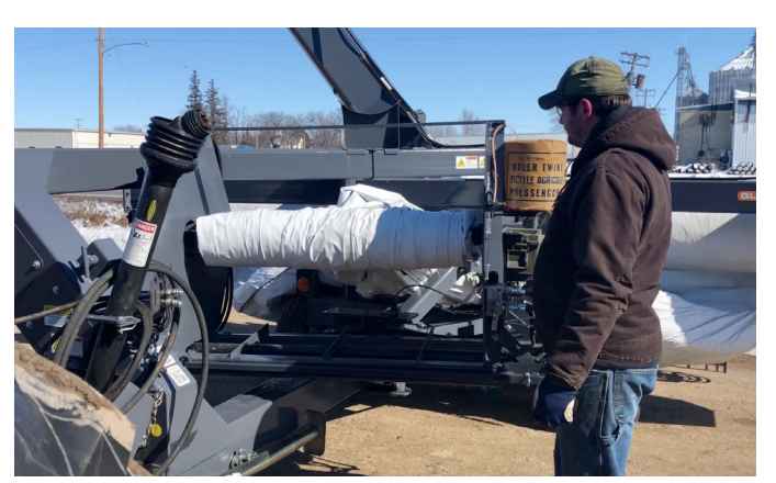
Winding the Bag