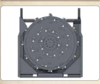
Housing Design: The sides of the Bad Ax housing are parallel. This design provides optimal control when compared with funnel, or V-shaped, disc mulchers, which can be easily misdirected when hooking onto stumps or other solid objects.