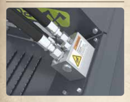
Anti-Cavitation Shutdown Circuit: An integrated anti-cavitation shutdown circuit protects motor during shutdown.