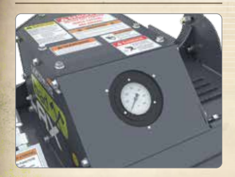
Instrumentation : A rubber-mounted pressure gauge allows the operator to easily monitor the workload from the skid steer cab.